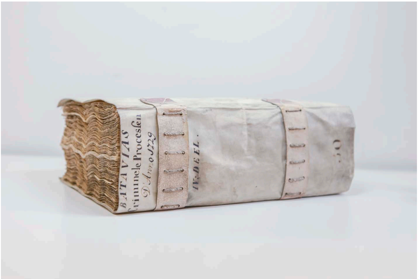
Drew Pettifer, Untitled (Journal #4) , 2019, chromogenic print, 27.6 x 38.2cm.