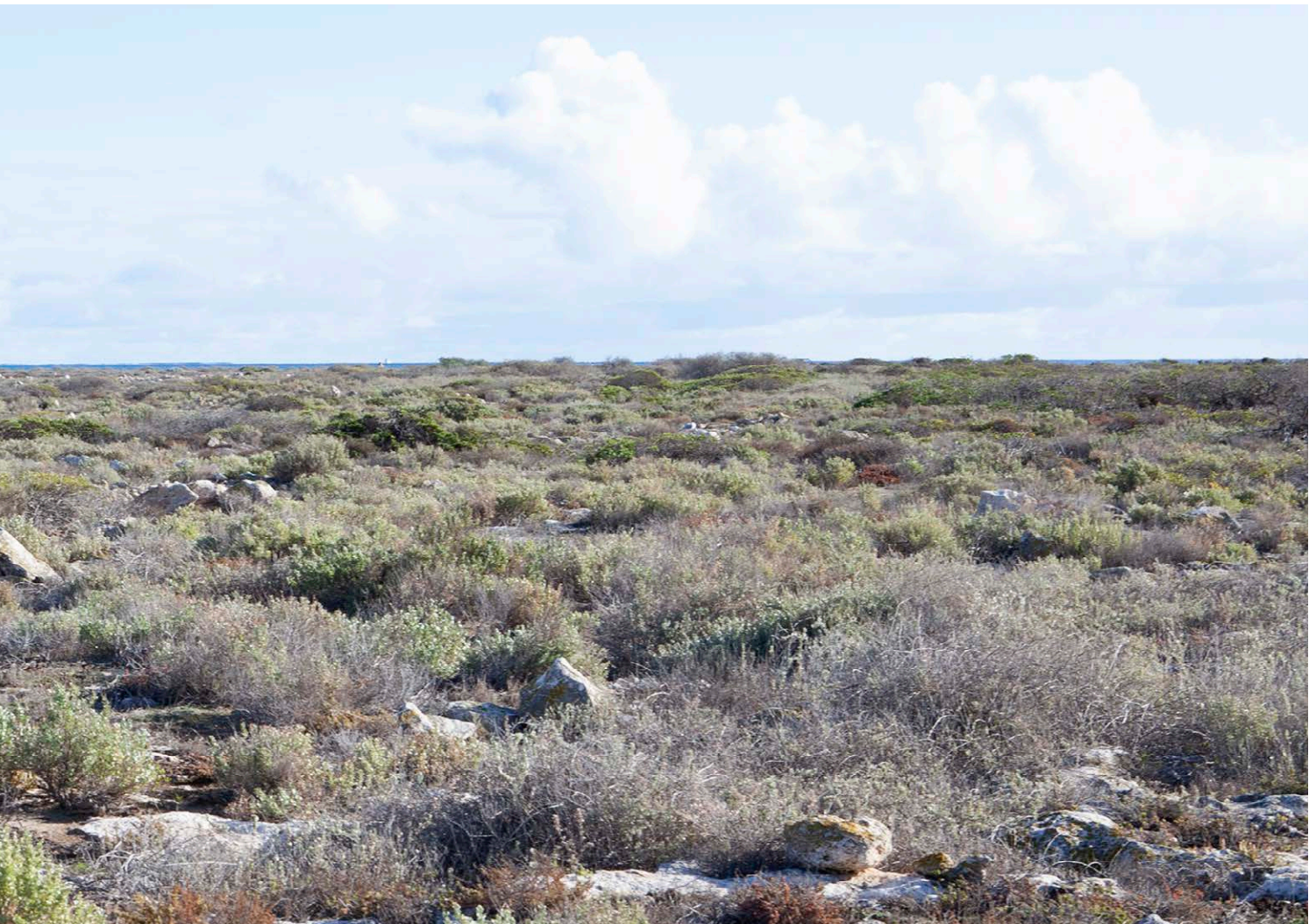
Drew Pettifer, Untitled (Gun Island) (detail), 2019, chromogenic print, 27.6 x 38.2cm. Image courtesy the artist

The elements of this extraordinary story are encapsulated in the installation of 45 small-scale framed photographs, hung in a grid, though with some grid places left blank to reflect the broken historical record. Nothing is complete, and no history is immutable, the gaps are eloquent reminders of slippage and omission. This body of work, and the major publication that will accompany it, will contribute to that expanded history. The essays, photographs of sites, the rescued objects, captain's log, maps, and documents provide the evidence on which we will all build our personalised chronicle.